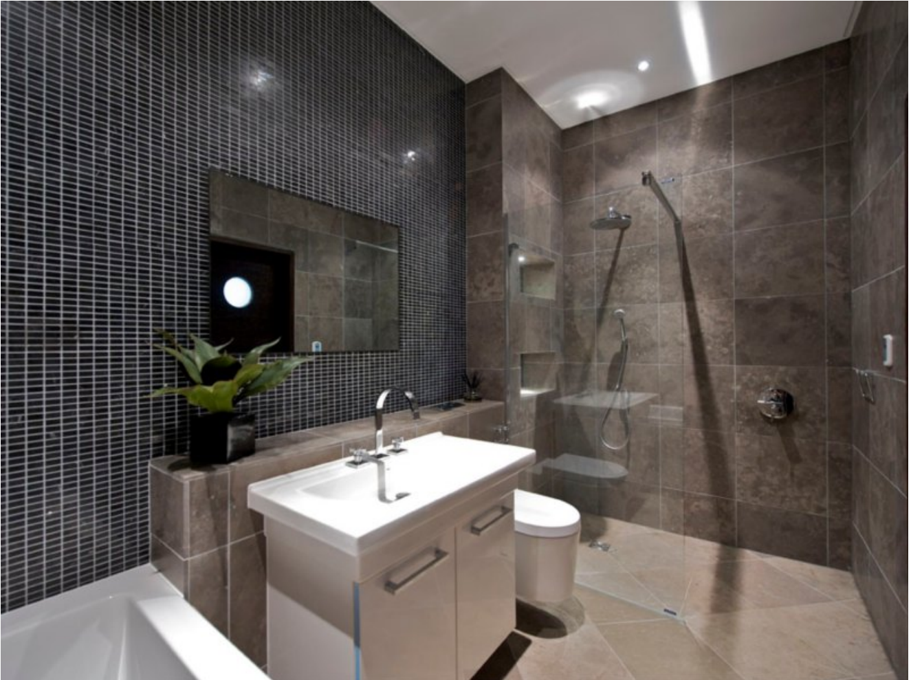
AZUL VALVERDE ALL