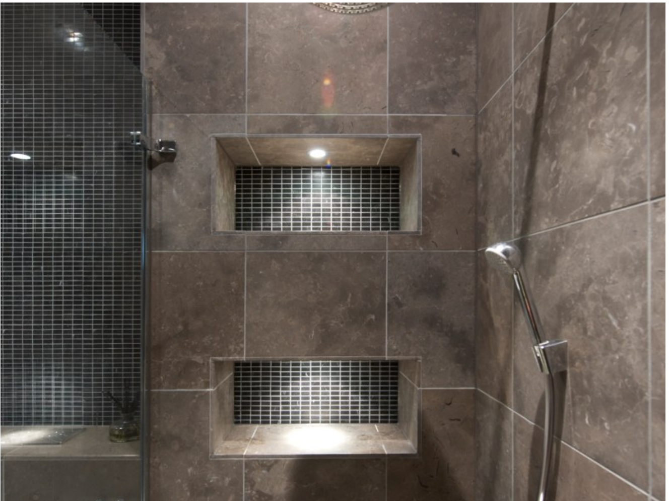
AZUL VALVERDE AZUL-VALVERDE