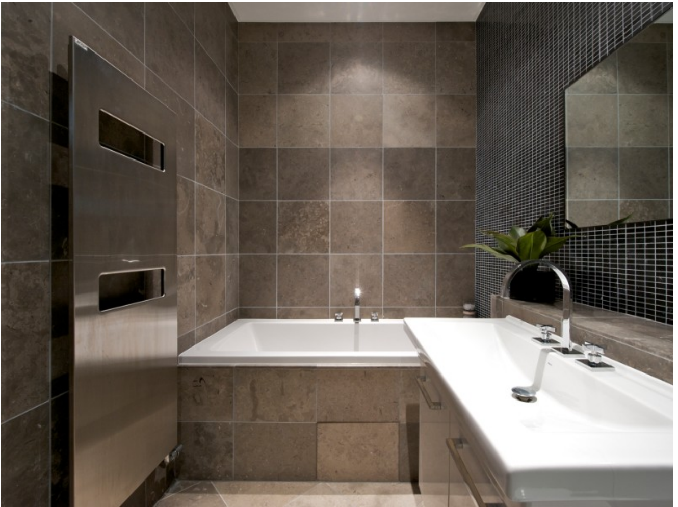
AZUL VALVERDE ALL