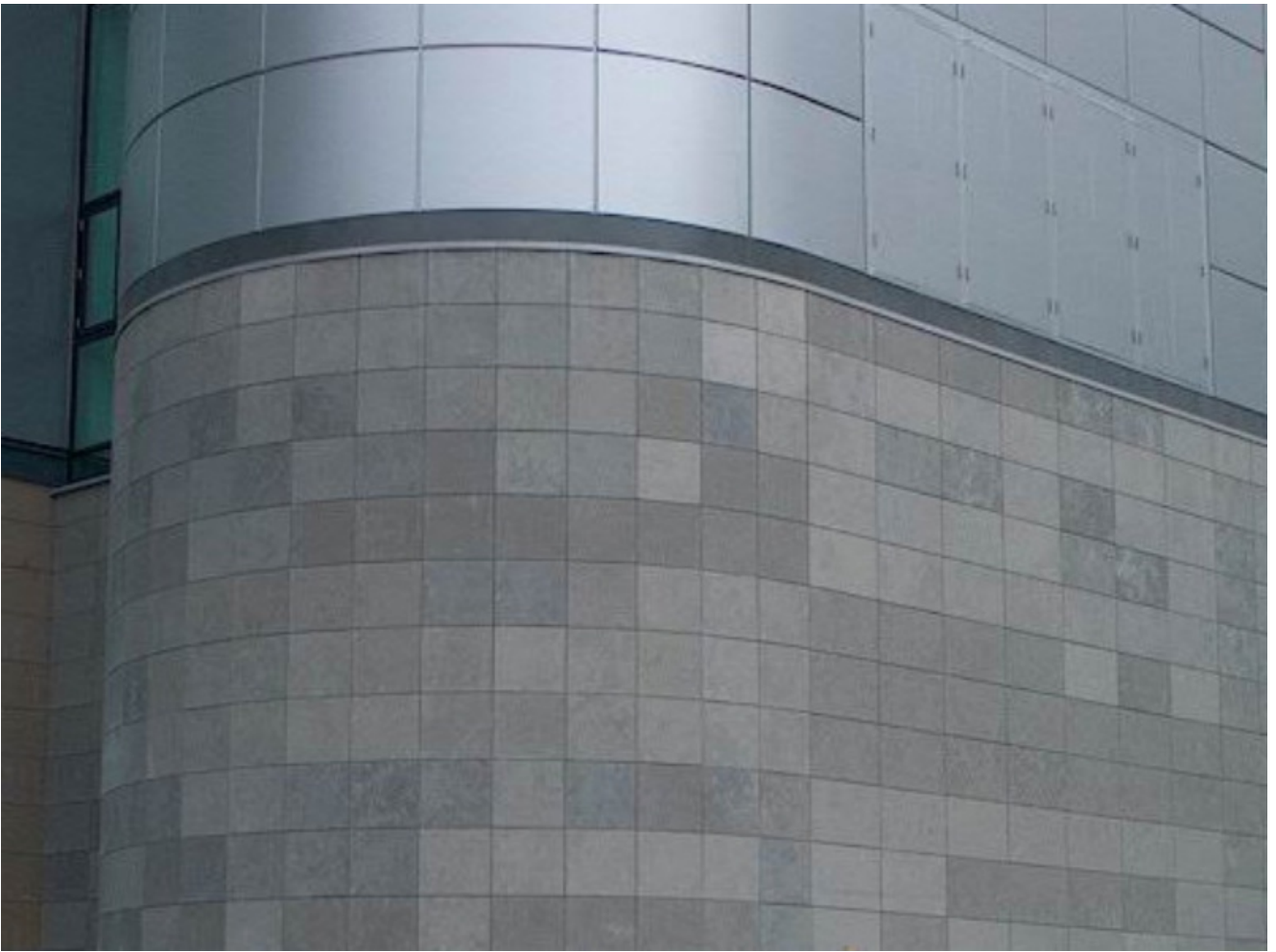
AZUL VALVERDE AZUL-VALVERDE