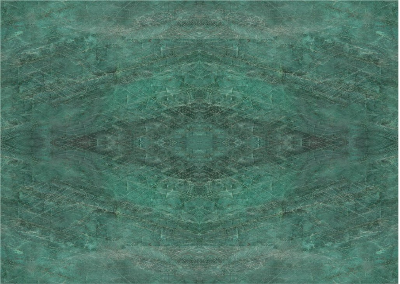
EMERALD DREAM EMERALD-DREAM