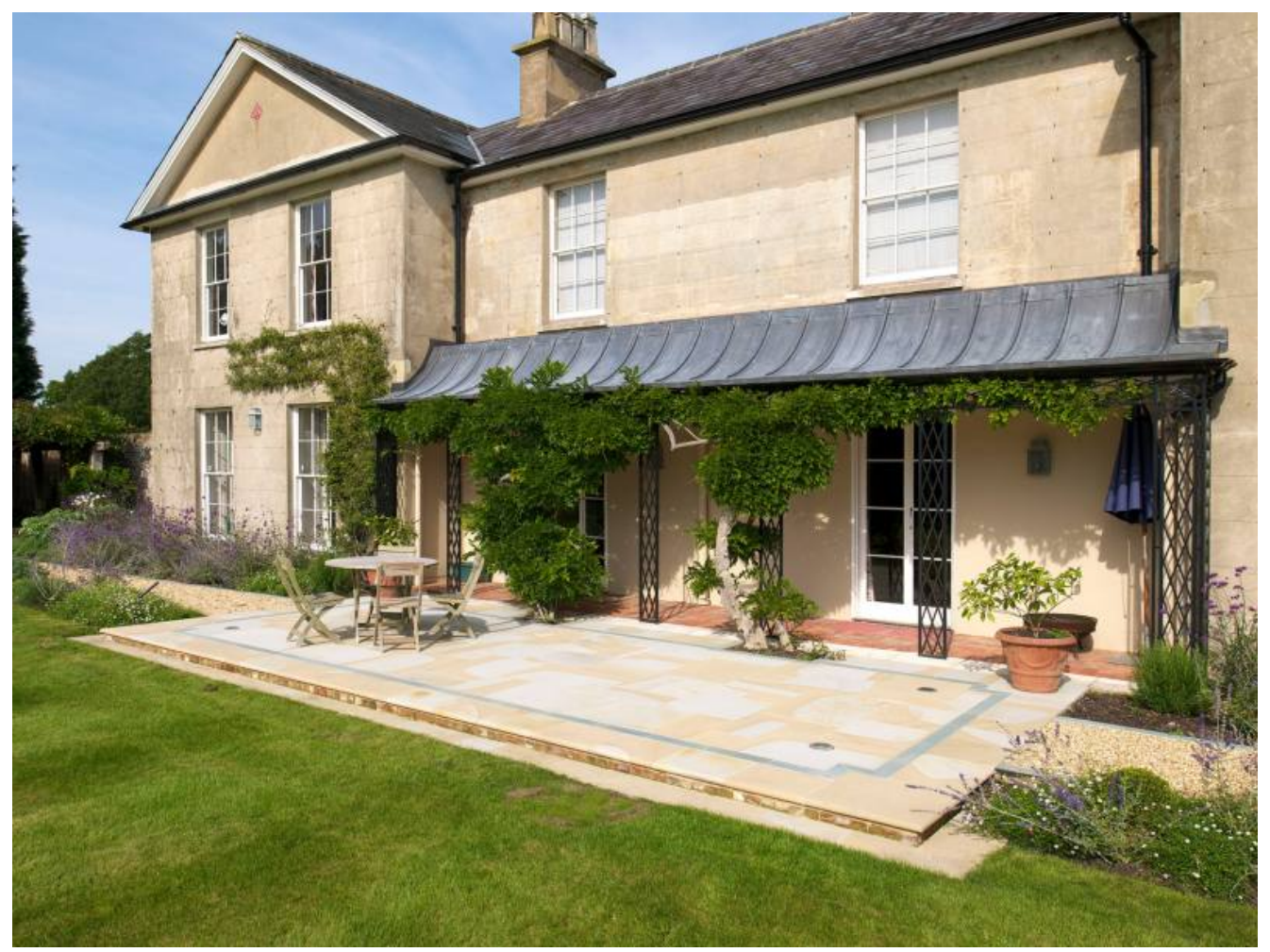
WINDSOR BUFF BLUE WINDSOR-BUFF-BLUE